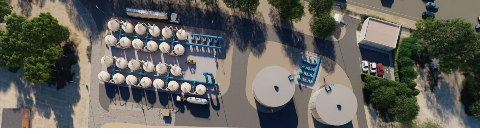
Williams Station PFAS Treatment Rendering