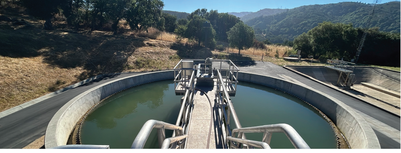
Sludge holding tank at Montevina Treatment Plant