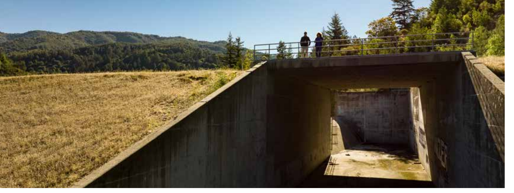
San Jose Water Staff at Austrian Dam.