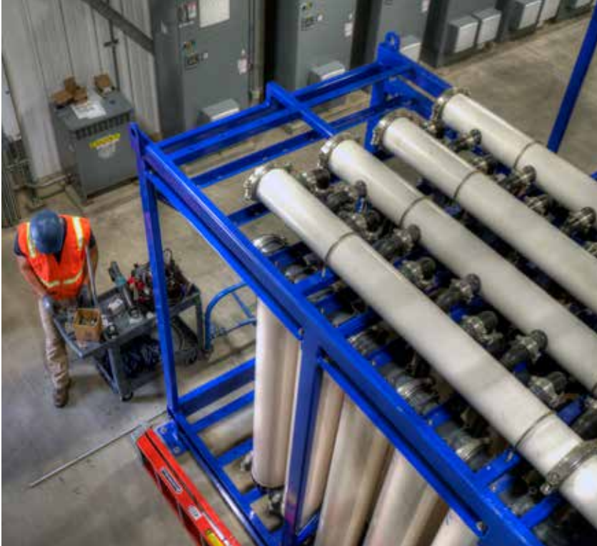
Ultrafiltration modules, like the one shown above, remove parasites, bacteria, and viruses from the water.