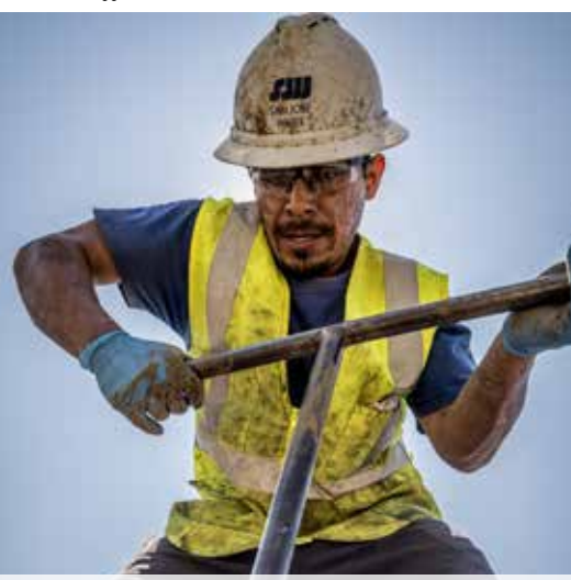
SJW Distribution System Workers repairing hydrants.