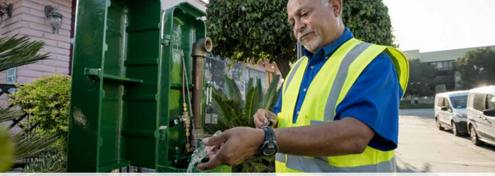
SJW Water Quality staff collecting samples in the distribution system.