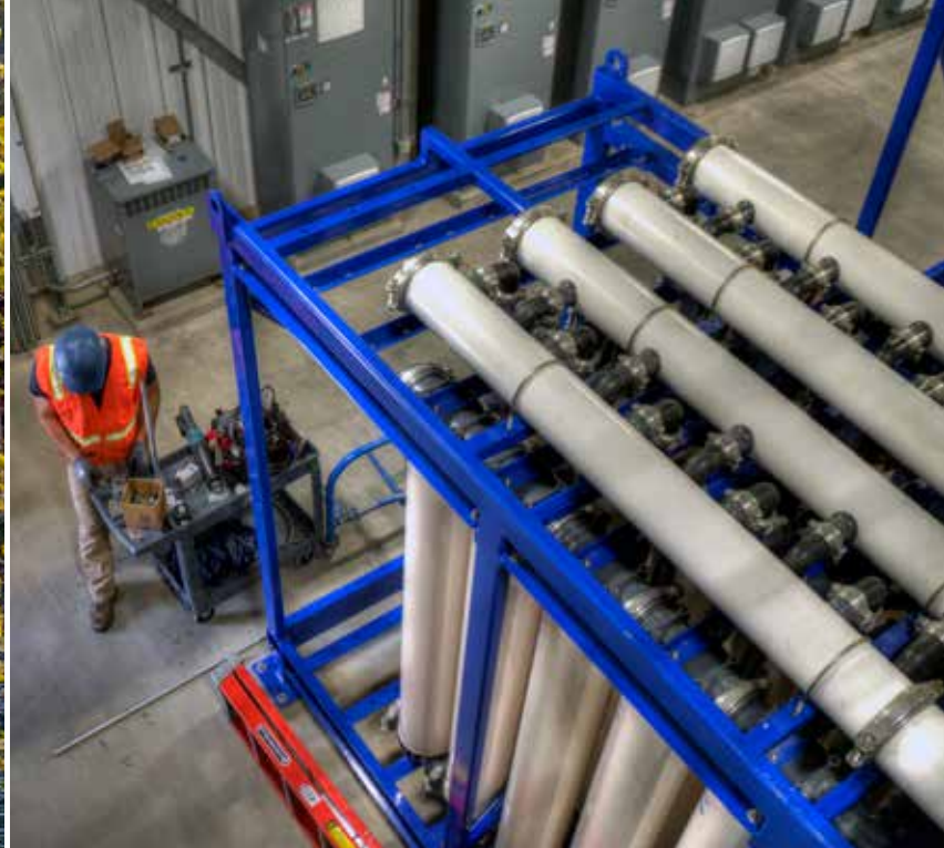
Ultrafiltration modules, like the one shown above, remove parasites, bacteria, and viruses from the water.