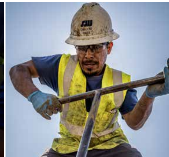
SJW Distribution System Workers repairing hydrants.