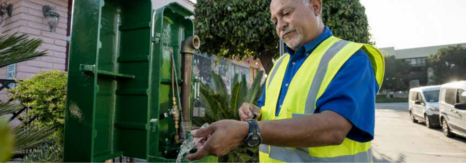
SJW Water Quality staff collecting samples in the distribution system.