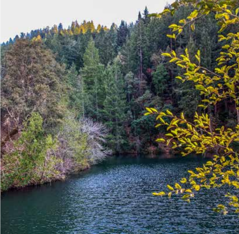
Lake Williams in the Los Gatos Watershed.