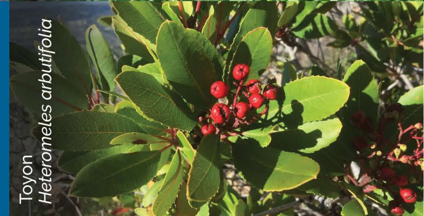
Toyon Heteromeles arbutifolia

If you have any questions or concerns, please contact San Jose Water at (408) 279-7885