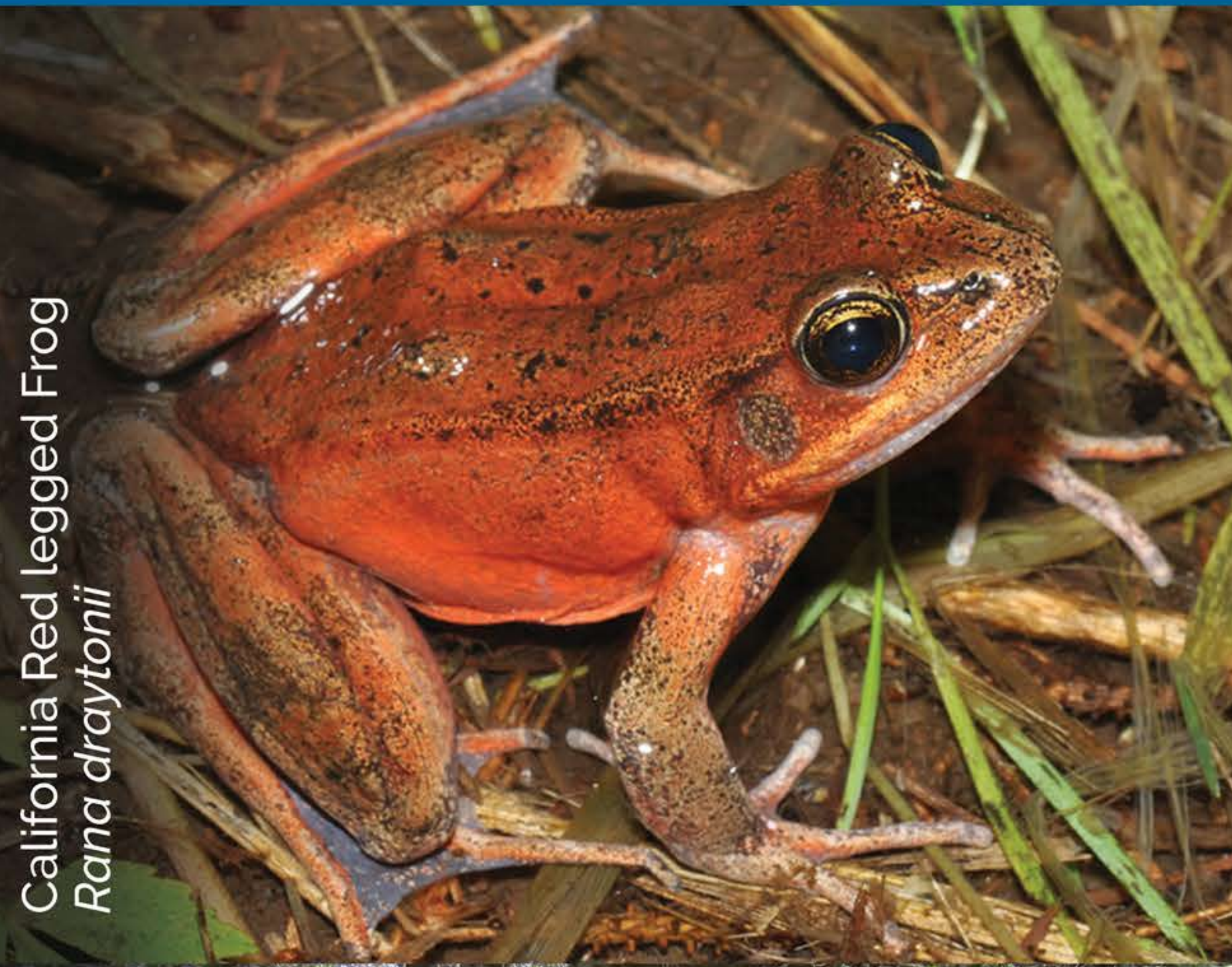
California Red legged Frog Rana draytonii

These constructed wetlands, riparian woodlands, and the adjacent lands support native species such as California red-legged frog, western pond turtle, coast live oak, and toyon.