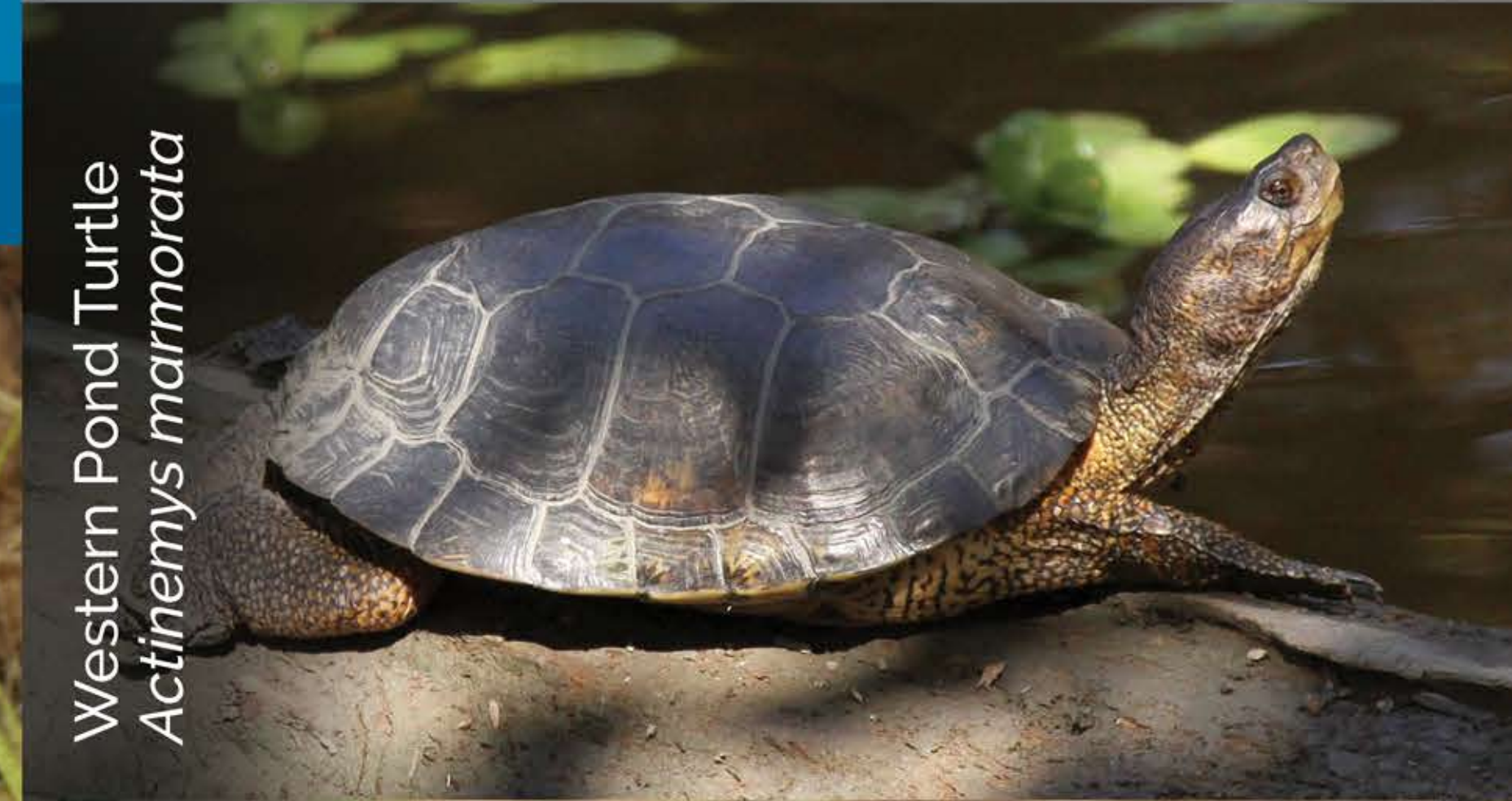
Western Pond Turtle Actinemys marmorata