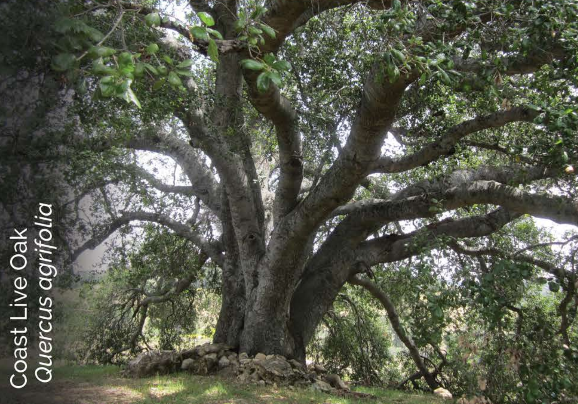
Coast Live Oak Quercus agrifolia