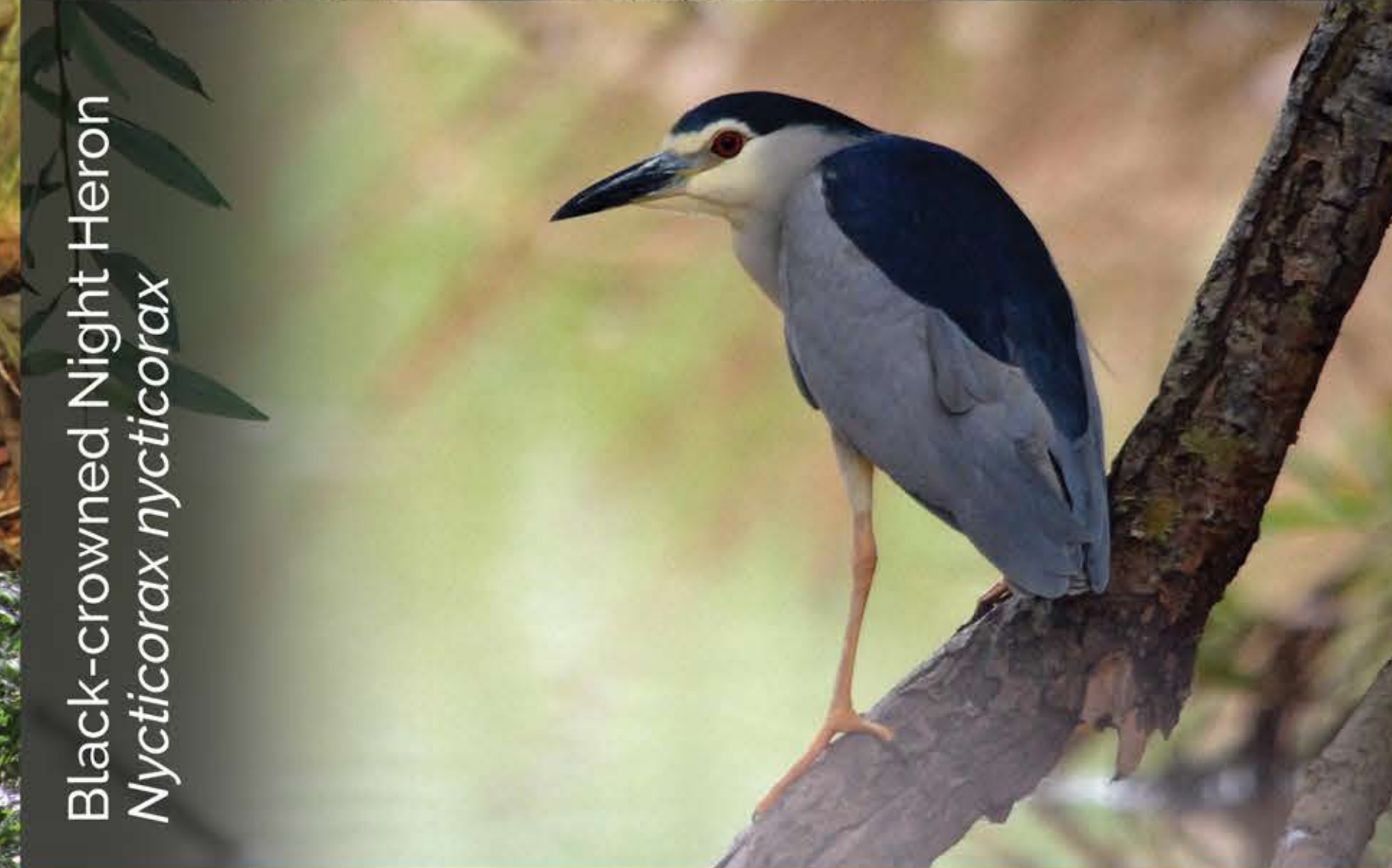
Black-crowned Night Heron Nycticorax nycticorax